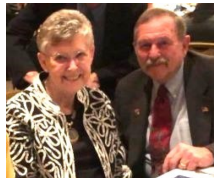
TOURNAMENT DEDICATION In Memory of: Roger & Sharon Schildroth

TOURNAMENT OPENS February 3, 2024 CLOSES April 28, 2024 (unless extended) NO WALK-INS