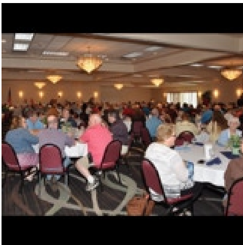
Delegates in Lansing during the annual meeting