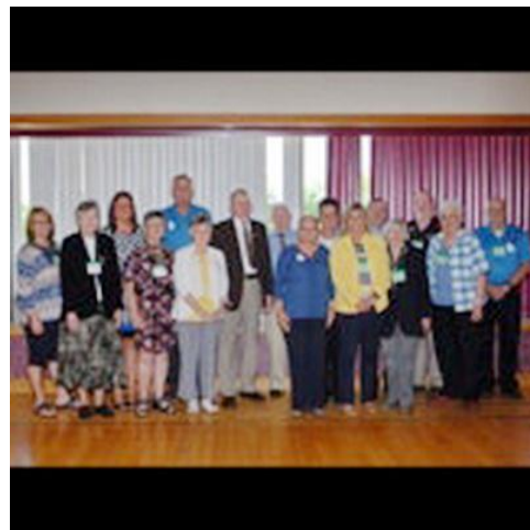
Pictured above are Michigan State USBC Hall of Fame members. They were introduced prior to this year's inductions.