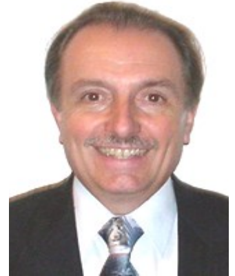
Michigan State USBC BA Hall of Fame Metro Detroit Hall of Fame Director—USBC Association Manager—Metro Detroit USBC